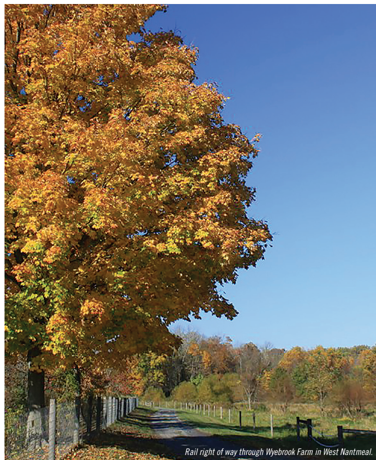
Rail right of way through Wyebrook Farm in West Nantmeal.