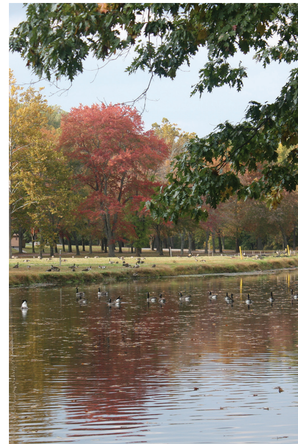
View from the existing Struble Trail, looking towards the Shady Acres Campground.

This study was financed in part by The William Penn Foundation and in part by a grant from the Community Conservation Partnerships Program Grants Cycle 2015-2016, Keystone Recreation, Park and Conservation Fund, under the administration of the Pennsylvania Department of Conservation and Natural Resources, Bureau of Recreation and Conservation.