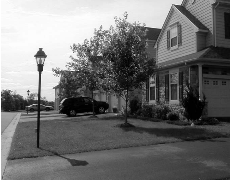
The architectural design is enhanced by design elements such as traditional street lighting and landscaping.