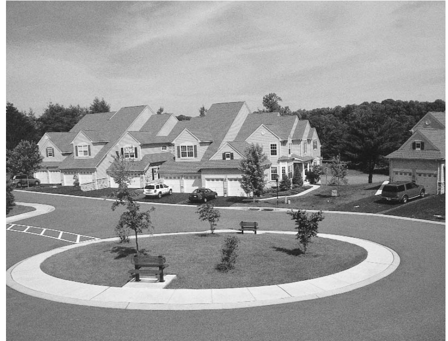
A landscaped circle reduces impervious surfaces and provides an area for a bench and sidewalk facilities.

The open space consists primarily of the Penn Oaks Golf Course that surrounds the residential subdivision. The golf course designers preserved a significant number of mature specimen trees, and two historic hedgerows just to the northwest of the residential uses. This preservation and integration of existing woodlands is also evident within the residential subdivision.