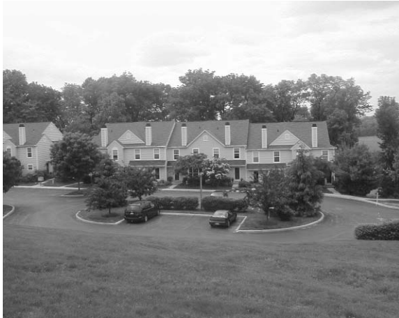
Landscaped parking and cul-de-sac islands are attractive and reduce the amount of impervious surface.