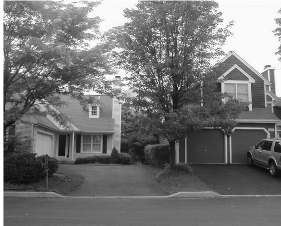
The single-family homes offer a variety of architectural designs that blend well with the thoughtful landscaping.