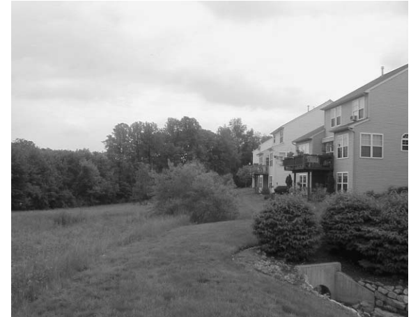
The development benefits from its proximity to Marsh Creek State Park.

The single-family homes are located in the southern portion of the tract and are surrounded on two sides by very large areas of open space. In addition to the open space, Marsh Harbour is adjacent to Marsh Creek State Park, affording views of the lake and associated woodland. The single-family homes are similar to those in Deerfield Knoll, with a variety of attractive architectural designs and colors. Some of the homes offer side-load garages which minimize the dominance of the garage. Sidewalks are provided but are not consistently located throughout the development. An historic structure has been preserved and is centrally located in the development.